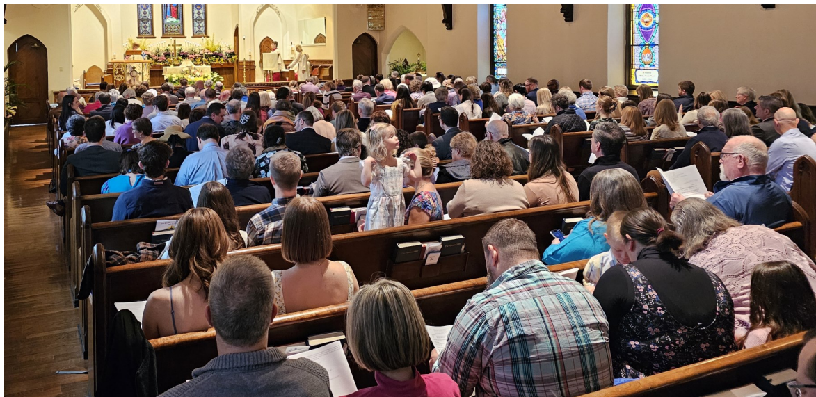
Easter Sunday 2025 at Christ Church