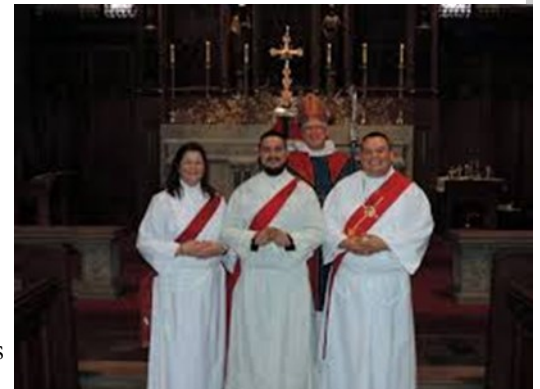
Newly ordained deacons with their Bishop Diocese of Fond du Lac