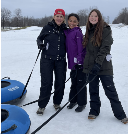
The Youth Group really enjoyed the tubing outing in February!